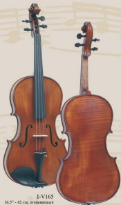
I-V165 16.5" - 42 CM, INTERMEDIATE 'GEMS 2' VIOLA