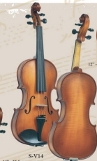
S-V14 14" - 35.5 CM, STUDENT 'GENIAL 1' VIOLA

Hand carved viola with the TOP made of solid Carpathian resonance spruce * The BACK, the SIDES and the NECK made of solid maple * With inlaid parfling on the top and back * Ebony accessories * Oil varnish * Rosewood round BOW * Light hard CASE * Rosin * Fully set-up * Ready to play.