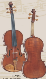
IG-V155 15.5" - 39.5, INTERMEDIATE 'GLORIA' VIOLA