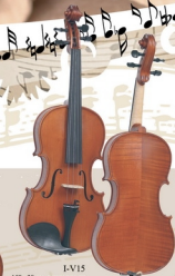
I-V15 15" - 38 CM, INTERMEDIATE 'GEMS 2' VIOLA