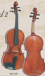
B-V155 15.5" - 39.5 CM, BEGINNER 'GENIAL 2' VIOLA

Hand carved viola with TOP made of solid Carpathian resonance spruce * The BACK, the SIDES and the NECK made of solid maple * With inlaid purfling on the top and back * Ebony accessories * Nitro varnish * Rosewood round BOW * Light hard CASE * Rosin * Fully set-up * Ready to play