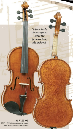
M-V155-OB 15,5" - 39,5 CM, MASTER GLIGA VASILE BIRD'S EYE ONE PIECE BACK VIOLA

Unique viola by the very special Bird's Eye Sycamore back, ribs and neck.