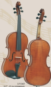
I-V165 16.5" - 42 CM, INTERMEDIATE "GENO 2" VIOLA