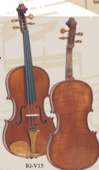
IG-V15 15" - 38 CM. INTERMEDIATE 'GLORIA' VIOLA