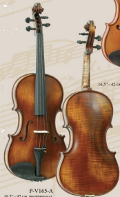
P-V165-A 16,5" - 42 CM, PROFESSIONAL 'GAMA' ANTIQUE VIOLA