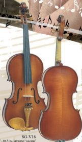
SG-V16 16" - 40.5 CM STUDENT 'GLORIA' VIOLA

Hand carved viola with the TOP made of solid Carpathian resonance spruce * The BACK, the SIDES and the NECK made of solid maple * With inlaid purfling on the top and back * Fingerboard is made of ebony * The other accessories are flamed maple * Oil varnish * Rosewood round BOW * Light hard CASE * Rosin * Fully set-up * Ready to play.