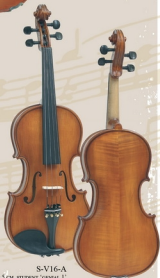
S-V16-A 16" - 40.5 CM, STUDENT "GENIAL 1" ANTIQUE VIOLA