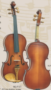
SG-V17 17" - 43.5 CM STUDENT 'GLORIA' VIOLA