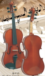
B-V15 15" - 38 CM, BEGINNER "GENIAL 2" VIOLA