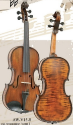
AW-V15-S 15" - 38 CM, WORKSHOP 'GEMS 1' SPECIAL ANTIQUE VIOLA