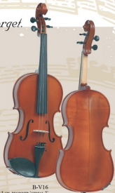
B-V16 16" - 40.5 CM, BEGINNER 'GENIAL 2' VIOLA

Hand carved viola with TOP made of solid Carpathian resonance spruce * The BACK, the SIDES and the NECK made of solid maple * With inlaid purfling on the top and back * Ebony accessories * Nitro varnish * Rosewood round BOW * Light hard CASE * Rosin * Fully set-up * Ready to play