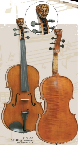
P-VI175-5 17.5" - 44.5 CM. PROFESSIONAL "GAMA" 5 STRING VIOLA