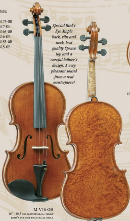
M-V16-OB 16" - 40,5 CM, MASTER GLIGA VASILE BIRD'S EYE ONE PIECE BACK VIOLA

Special Bird's Eye Maple back, ribs and neck, best quality Spruce top and a careful luthier's design. A very pleasant sound from a real masterpiece!