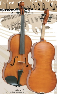
AW-V17 17" - 43.5 CM. WORKSHOP "GEMS 1" VIOLA