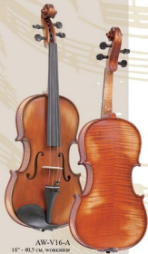
AW-V16-A 16" - 40.5 CM. WORKSHOP "GEMS 1" ANTIQUE VIOLA