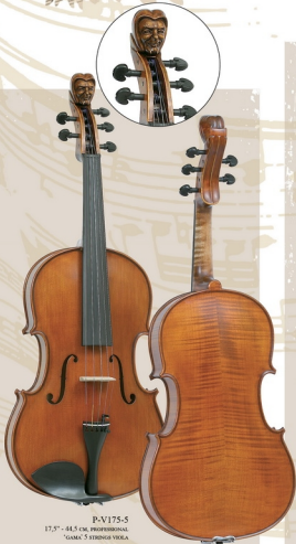
P-VI175-5 17.5" - 44.5 CM. PROFESSIONAL "GAMA" 5 STRING VIOLA