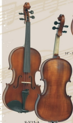
S-V15-A 15" - 38 CM, STUDENT 'GENIAL 1' ANTIQUE VIOLA

Hand carved viola with the TOP made of solid Carpathian resonance spruce * The BACK, the SIDES and the NECK made of solid maple * With inlaid parfling on the top and back * Ebony accessories * Oil varnish * Rosewood round BOW * Light hard CASE * Rosin * Fully set-up * Ready to play.