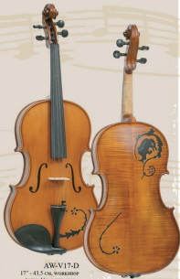
AW-V17-D 17" - 43.5 CM, WORKSHOP 'GEMS 1' PAINTED VIOLA