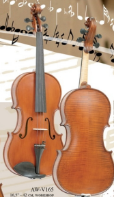
AW-V165 16.5" - 42 CM. WORKSHOP "GEMS 1" VIOLA