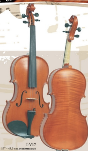
I-V17 17" - 43.5 CM, INTERMEDIATE "GENO 2" VIOLA