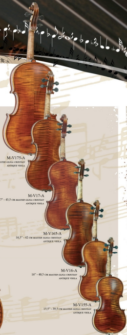
M-V175-A 17,5" - 44,5 CM MASTER GLIGA CRISTIAN ANTIQUE VIOLA