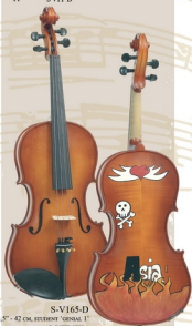
S-V165-D 16.5" - 42 CM, STUDENT 'GENIAL 1' PAINTED VIOLA