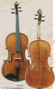
P-V17 17" - 43.5 CM, PROFESSIONAL 'GAMA' VIOLA