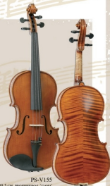
PS-V155 15.5" - 39.5 CM, PROFESSIONAL 'GAMA' SUPER VIOLA