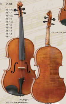
PS-V175 17.5" - 44.5 CM, PROFESSIONAL 'GAMA' SUPER VIOLA