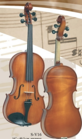
S-V16 16" - 40.5 CM, STUDENT "GENIAL 1" VIOLA