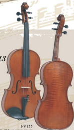
I-V155 15.5" - 39.5 CM, INTERMEDIATE 'GEMS 2' VIOLA