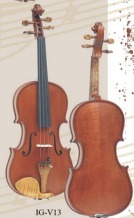
IG-V13 13" - 33.7 CM. INTERMEDIATE 'GLORIA' VIOLA

Hand carved viola with the TOP made of solid Carpathian resonance spruce * The BACK, the SIDES and the NECK made of solid maple * With inlaid purfling on the top and back * Fingerboard is made of ebony * The other accessories are flamed maple * Oil varnish * Rosewood octagonal BOW * Light hard CASE * Rosin * Fully set-up * Ready to play.