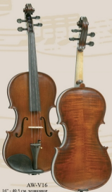
AW-V16 16" - 40.5 CM. WORKSHOP "GEMS 1" VIOLA