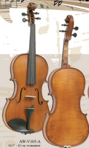
AW-V165-A 16.5" - 42 CM. WORKSHOP "GEMS 1" ANTIQUE VIOLA