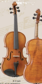
P-V165 16,5" - 42 CM, PROFESSIONAL 'GAMA' VIOLA