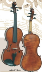
AW-V14-A 14" - 35.5 cm. WORKSHOP 'GEMS 1' ANTIQUE VIOLA