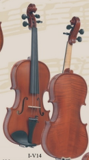
I-V14 14" - 35.5 CM, INTERMEDIATE 'GEMS 2' VIOLA