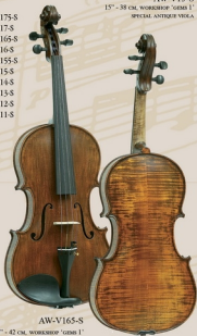
AW-V165-S 16.5" - 42 CM, WORKSHOP 'GEMS 1' SPECIAL ANTIQUE VIOLA