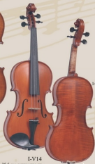
I-V14 14" - 35.5 CM, INTERMEDIATE VIOLA