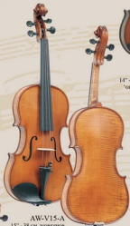
AW-V15-A 15" - 38 cm. WORKSHOP 'GEMS 1' ANTIQUE VIOLA