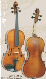
AW-V155-A 15.5" - 39.5 cm. WORKSHOP 'GEMS 1' ANTIQUE VIOLA