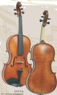
I-V17-A 17" - 43.5 CM, INTERMEDIATE "GENO 2" ANTIQUE VIOLA