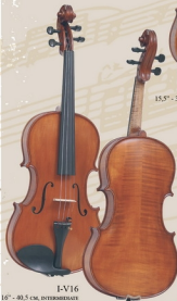
I-V16 16" - 40.5 CM, INTERMEDIATE 'GEMS 2' VIOLA