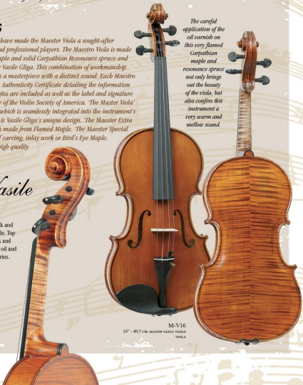
M-V16 16" - 40.5 CM, MASTER GLIGA VASILE VIOLA

The careful application of the oil finish on this very flamed Carpathian maple and resonance spruce not only brings out the beauty of the viola, but also confers this instrument a very warm and mellow sound.