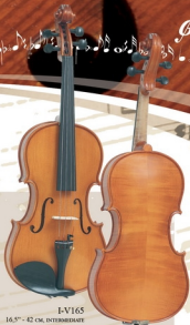
I-V165 16.5" - 42 CM, INTERMEDIATE "GENO 2" VIOLA