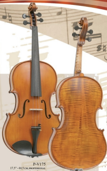
P-V175 17.5" - 44.5 CM, PROFESSIONAL 'GAMA' VIOLA