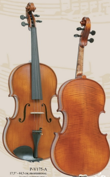
P-V175-A 17.5" - 44.5 CM, PROFESSIONAL 'GAMA' ANTIQUE VIOLA