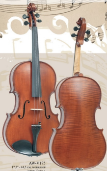
AW-V175 17.5" - 44.5 CM. WORKSHOP 'GEMS 1' VIOLA