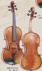
AW-V15-A 15" - 38 cm. WORKSHOP 'GEMS 1' ANTIQUÉ VIOLA