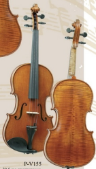
P-V155 15,5" - 39,5 CM, PROFESSIONAL 'GAMA' VIOLA