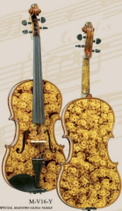
M-V16-Y 16" - 41.5 CM, SPECIAL MAESTRO GILGA VASILE PYROGRAPHED VIOLA

'Pyrography' is the art of burning designs into wood, paper, bone or other material. A Pyrographer has the ability to create a vast range of images with beautiful effects on any kind of instrument. Pyrographic images are carefully designed using electric or solar heated tools.