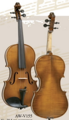
AW-V155 15.5" - 39.5 cm. WORKSHOP 'GEMS 1' VIOLA