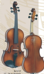
B-V15 15" - 38 CM, BEGINNER "GENIAL 2" VIOLA