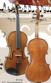
P-V16 16,5" - 42 CM, PROFESSIONAL 'GAMA' VIOLA