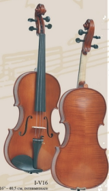
I-V16 16" - 40.5 CM, INTERMEDIATE "GENO 2" VIOLA

Hand carved viola with the TOP made of solid Carpathian resonance spruce * The BACK the SIDES and the NECK made of solid maple * With inlaid purfling on the top and back * Ebony accessories * Oil varnish * Rosewood octagonal BOW * Light hard CASE * Rostin * Fully set-up * Ready to play