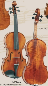
P-V16-A 16" - 40,5 CM, PROFESSIONAL 'GAMA' ANTIQUE VIOLA