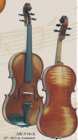
AW-V16-A 16" - 40.5 CM. WORKSHOP "GEMS 1" ANTIQUE VIOLA