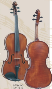
I-V165-O 16.5" - 42 CM. INTERMEDIATE ONE PIECE BACK VIOLA