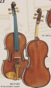
SG-V165 16.5" - 42 CM STUDENT 'GLORIA' VIOLA