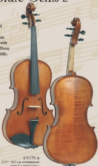
I-V175-A 17.5" - 44.5 CM, INTERMEDIATE 'GEMS 2' ANTIQUE VIOLA