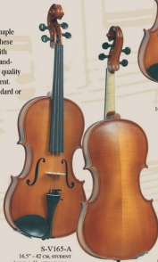
S-V165-A 16.5" - 42 CM, STUDENT "GENIAL 1" ANTIQUE VIOLA