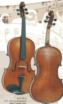
I-V175-A 17.5" - 44.5 CM, INTERMEDIATE 'GEMS 2' ANTIQUE VIOLA